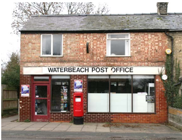
Post Office - 2011