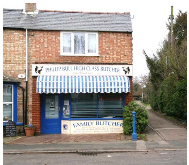
Bull's Butchers - 2011