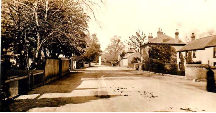
High Street - Early 1900s