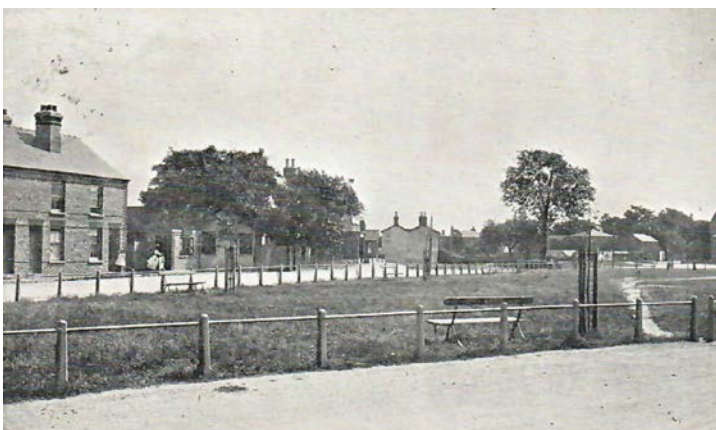
Greenside - Early 1900s

Site of 16 Greenside H. Cooke and Son carpenters and funeral directors