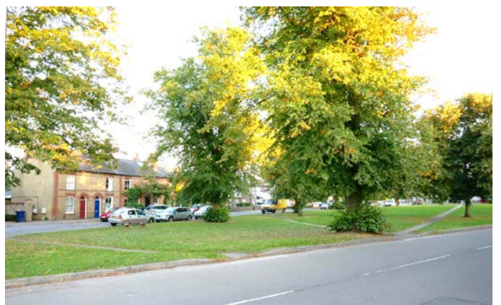
Greenside - 2018

14 Greenside Batten butchers, then a newsagent's, now One Stop