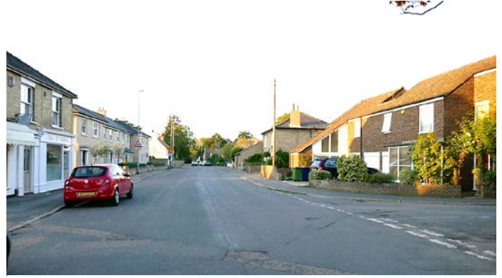
High Street - 2018

Site of 19b & 19c High Street A shed where eggs were tested.