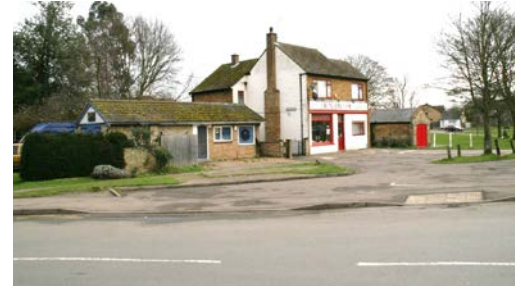
View from the Green to the Gault Early 1900s and 2011

Small hut to the right of 6 Greenside at the entrance to 4 Greenside